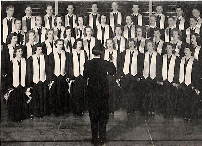
The 1945-46 A Cappella Choir

From the $1000 contribution of the Women's Missionary Society, the college has purchased a 16 m.m. Bell-Howe sound projector, a kodascope, a movie camera, and a new and larger screen.