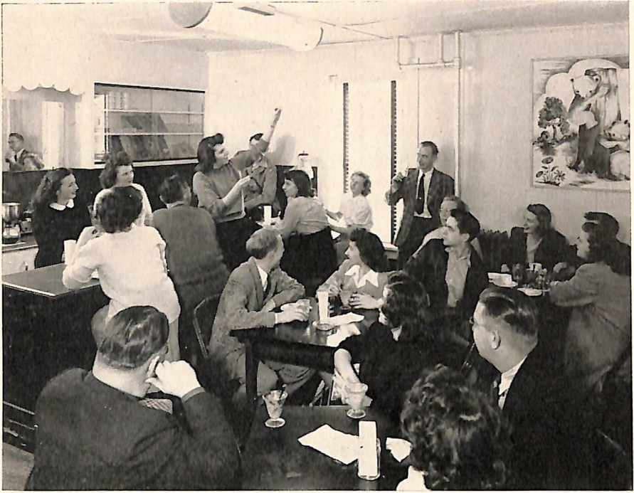
The New "Canteen"