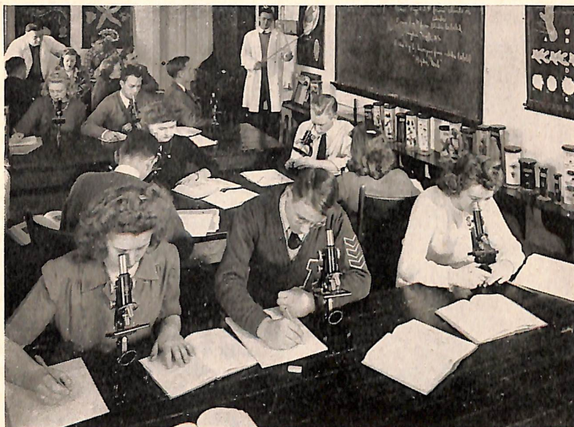
BIOLOGY LAB. $1500 has been spent in the Biology Lab. Similar or proportional amounts will be spent in other laboratories this coming school year.